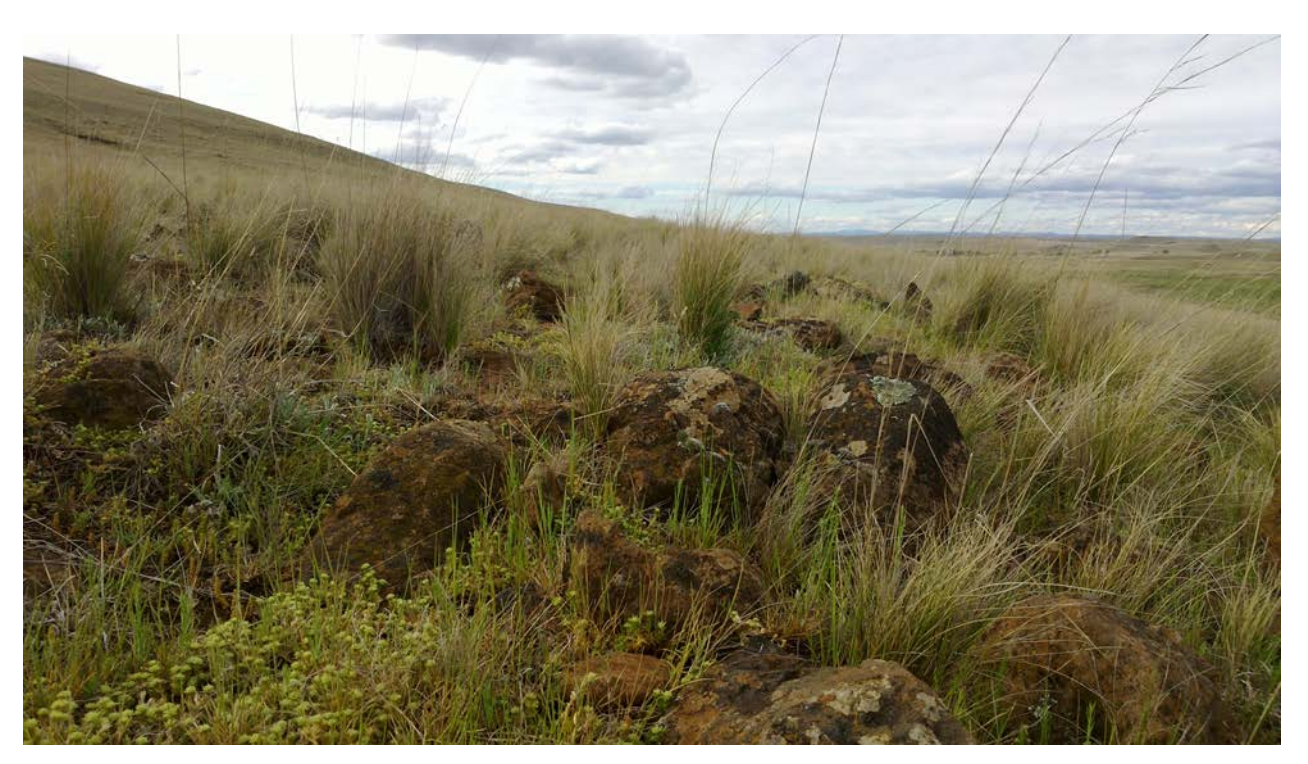
Figure 2. Natural Temperate Grassland.