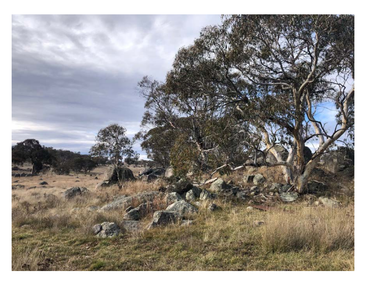
Figure 1. Snow Gum Woodland.

This guide is to assist landholders who are interested in participating in the Snow Gum Woodlands and Grasslands conservation tender. The Biodiversity Conservation Trust (BCT) is offering landholders with native vegetation an opportunity to diversify their income by earning annual management payments for conserving native vegetation on their property.