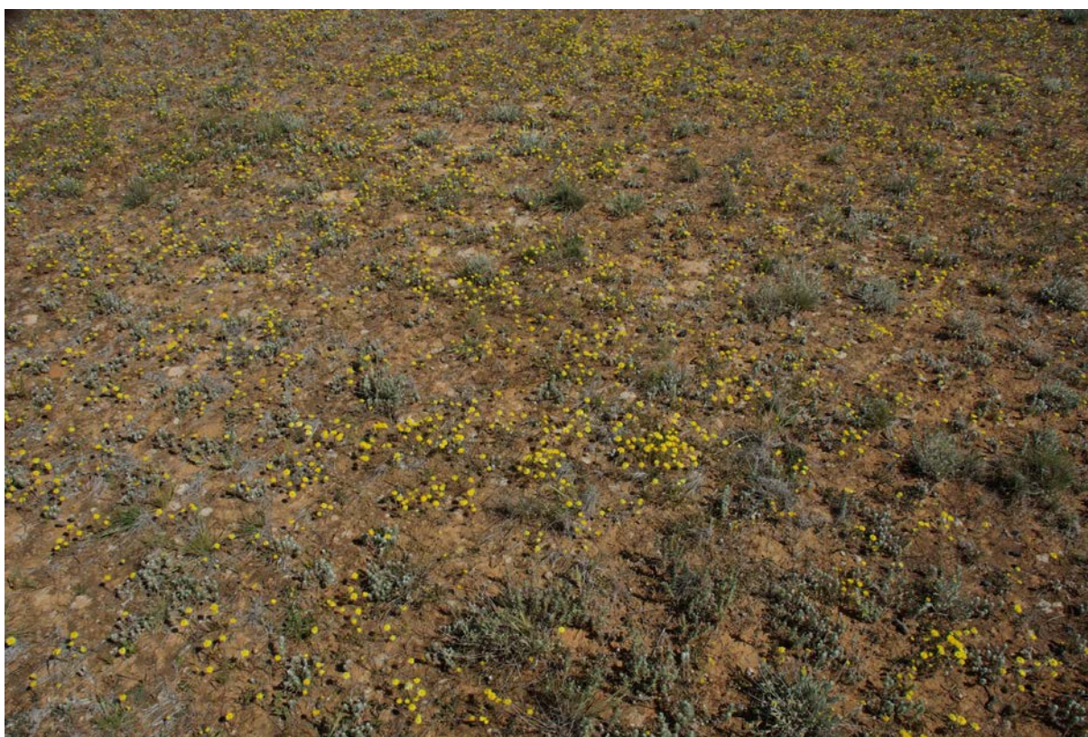
Figure 1 Plains-wanderer habitat managed to ideal condition, NSW Riverina Plains.

This guide is to assist landholders who are interested in participating in the Plains-wanderer Conservation Tender. The Plains-wanderer is an endangered bird of the Riverina grasslands for which protection and management of habitat on private land is a key part of species recovery. The Biodiversity Conservation Trust (BCT) is offering landholders with Plains-wanderer habitat an opportunity to diversify their income by earning annual management payments for actively managing Plains-wanderer habitat on their property.